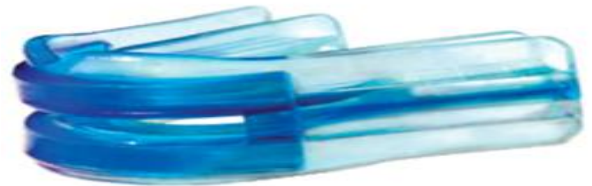
Boil and Bite Mouth guard (legal for upper and lower braces)