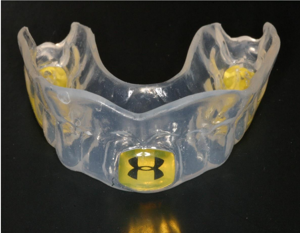
Under Armour Brand Mouth guard (legal for only upper braces)