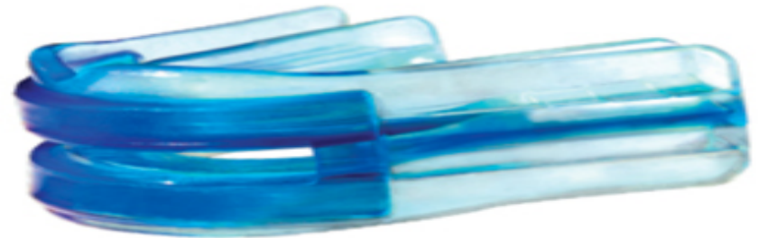
Boil and Bite Mouth guard (legal for upper and lower braces)